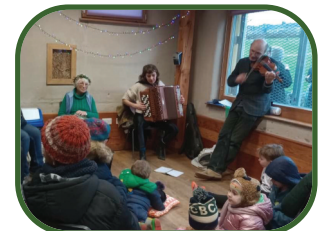
Musicians at Wassail