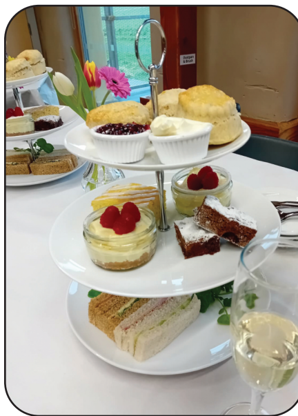
Spread for Mother's Day

We have also developed a great catering menu for private parties and events that also brings in a new strand of income.