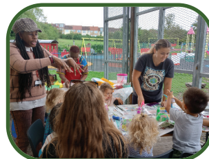
Flower Show workshop