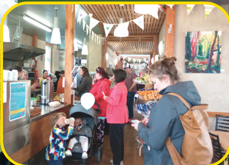
Fun at the Hub