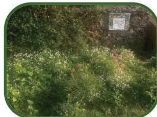
Ruth's Wildflower Garden