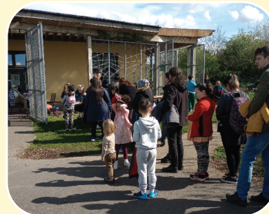
Long queue for our popular Easter Egg Hunt

During 2023 we had 19 events! Some were organised in collaboration with the Friends, such as the Wassail, Bioblitz, Flower & Produce Show, Cloud Appreciation Day and the River Event, and some were Hub Events.