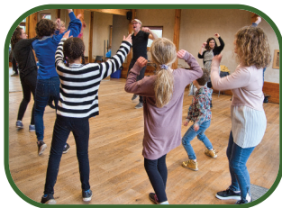
Community Day Fun